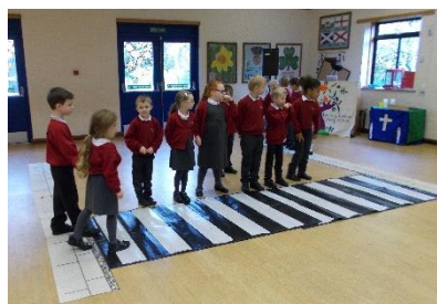
Year 1 enjoyed their Road Safety training on Monday

Following their talk this week, Year 3 will take part in a road safety walk on Monday