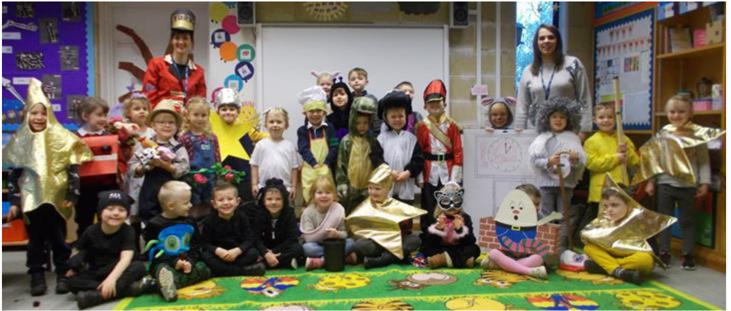
Lime Class had a great day dressed as Nursery Rhyme characters. A huge thank you to all the parents for creating such great costumes.

During Christmas Craft Club this week, the children decorated cupcakes to take home in the boxes they made last week. Well done everyone, your cakes looked amazing!