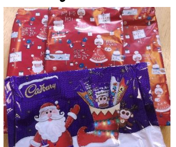
£1 each Available from the office

Please ensure your child's PE Kit is in school every day and is clearly labelled